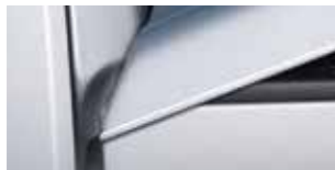
Front Fits Down and Over Truck Bed