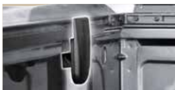
Low Profile Composite Clamp