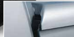
Extra Width at Front Corners