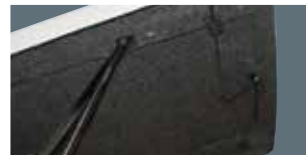
Gray Carpet Interior