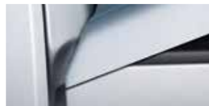
Front Fits Down and Over Truck Bed