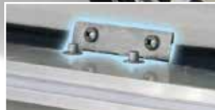
Stainless Steel Hinges