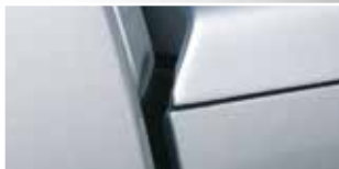
Precise Front Fit