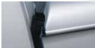
Extra Width at Front Corners