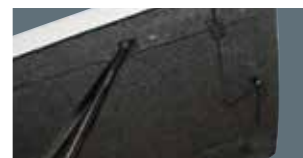
Gray Carpet Interior