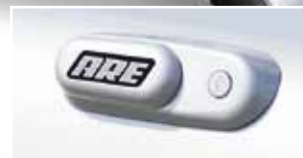
Automotive Grade Lock System