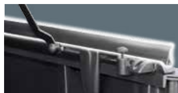
Modular Baserail with Weather-Resistant Seal