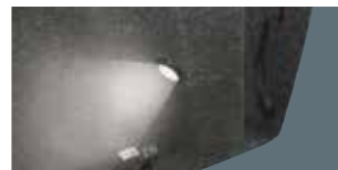
Carpeted Hardware Shroud with Interior Light