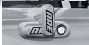
Automotive Grade Lock System