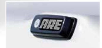
Black Lever Handle