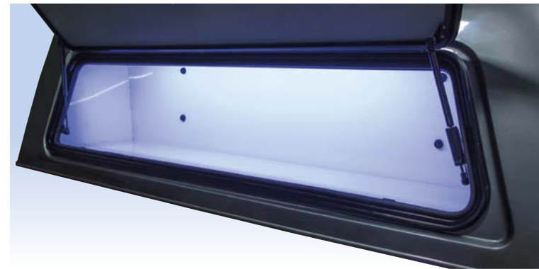
New - Toolbox Rope Lighting Option. The light turns on/off when the door opens/closes.