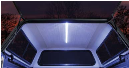
4' Center Rope Light - fiberglass truck cap without fabric interior liner.