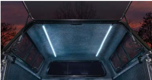
Double the effect with two 4' LED rope lights!