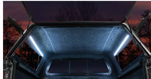
Side Window Rope Lights are automatically activated when the door opens!