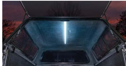
4' Center Rope Light - fiberglass truck cap with fabric interior liner.