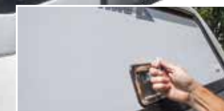
Optional Aluminum Paneled Rear Door with Folding T-Handles & BOLT One-Key Technology