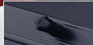
Single T-Lock Heavy-Duty Rear Door