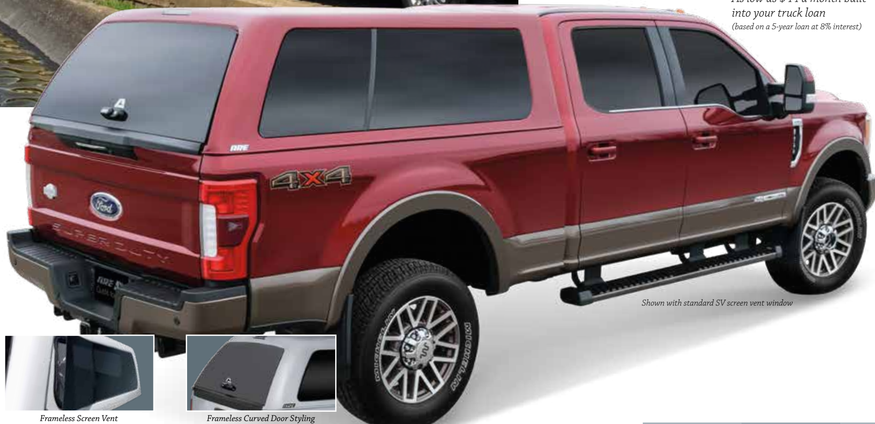
Shown with standard SV screen vent window