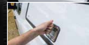
Optional Aluminum Paneled Windows with Folding T-Handles & BOLT One-Key Technology