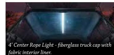
4' Center Rope Light - fiberglass truck cap with fabric interior liner.