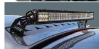
Rival™ LED Light Bar