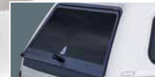
Heavy-Duty Aluminum Door