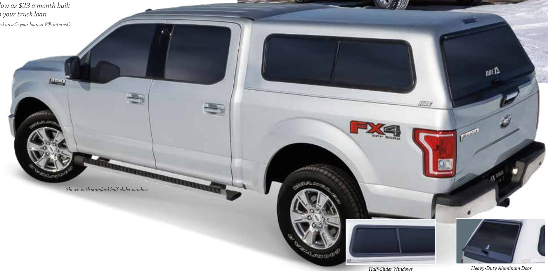
Shown with standard half-slider window