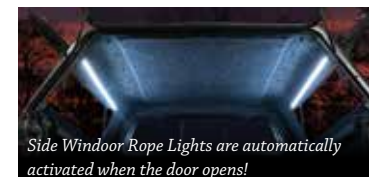
Side Window Rope Lights are automatically activated when the door opens!