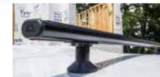
Optional HD Series Roof Rack