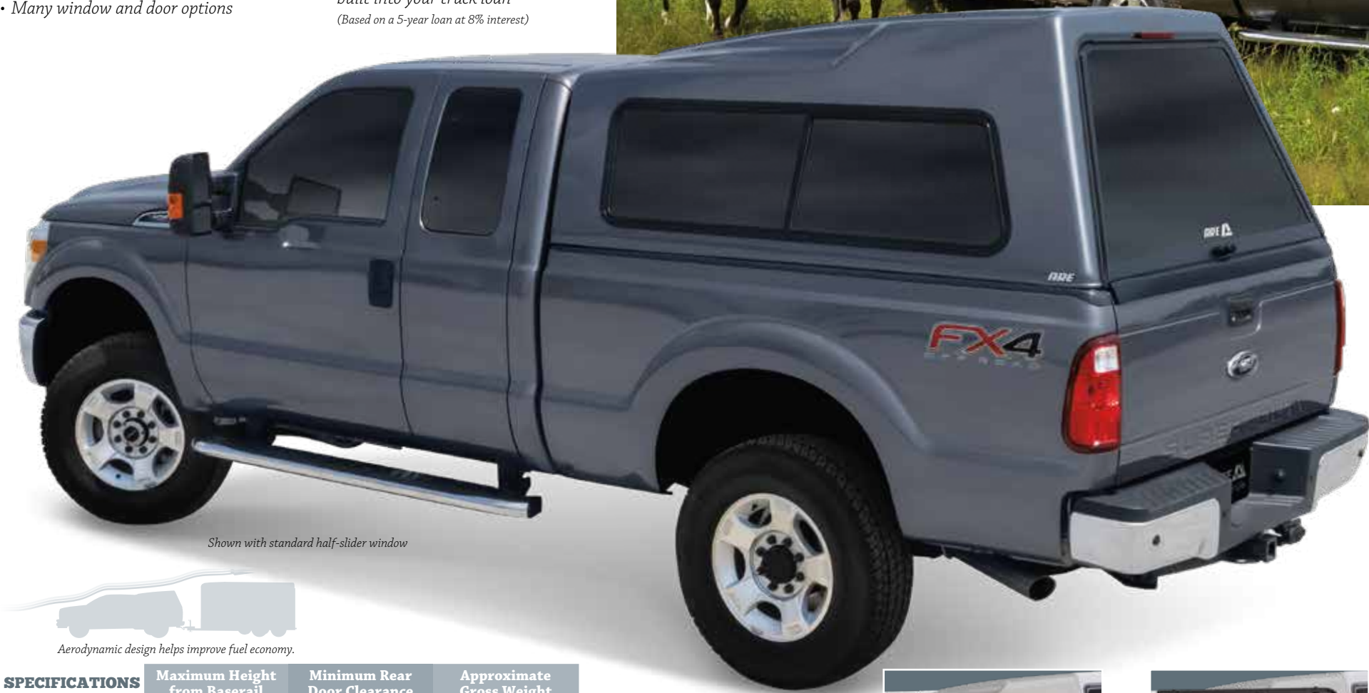
Shown with standard half-slider window.