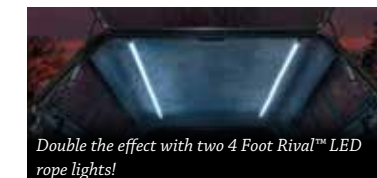
Double the effect with two 4 Foot Rival™ LED rope lights!