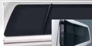
Optional SV Screen Vent Window Package