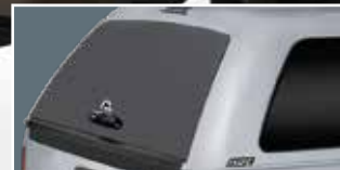
Frameless Curved Door Styling