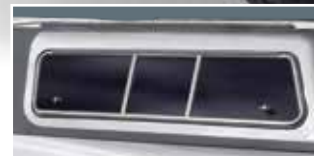
Optional Outdoorsman Window Package