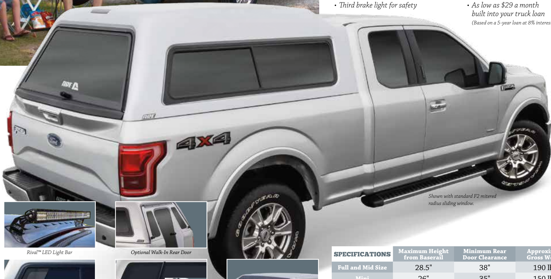
Shown with standard F2 mitered radius sliding window.