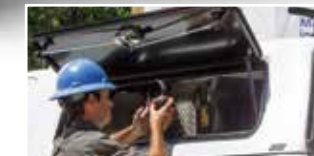
Optional Diamond Plate Toolboxes Depth 12"-16" depending on truck model