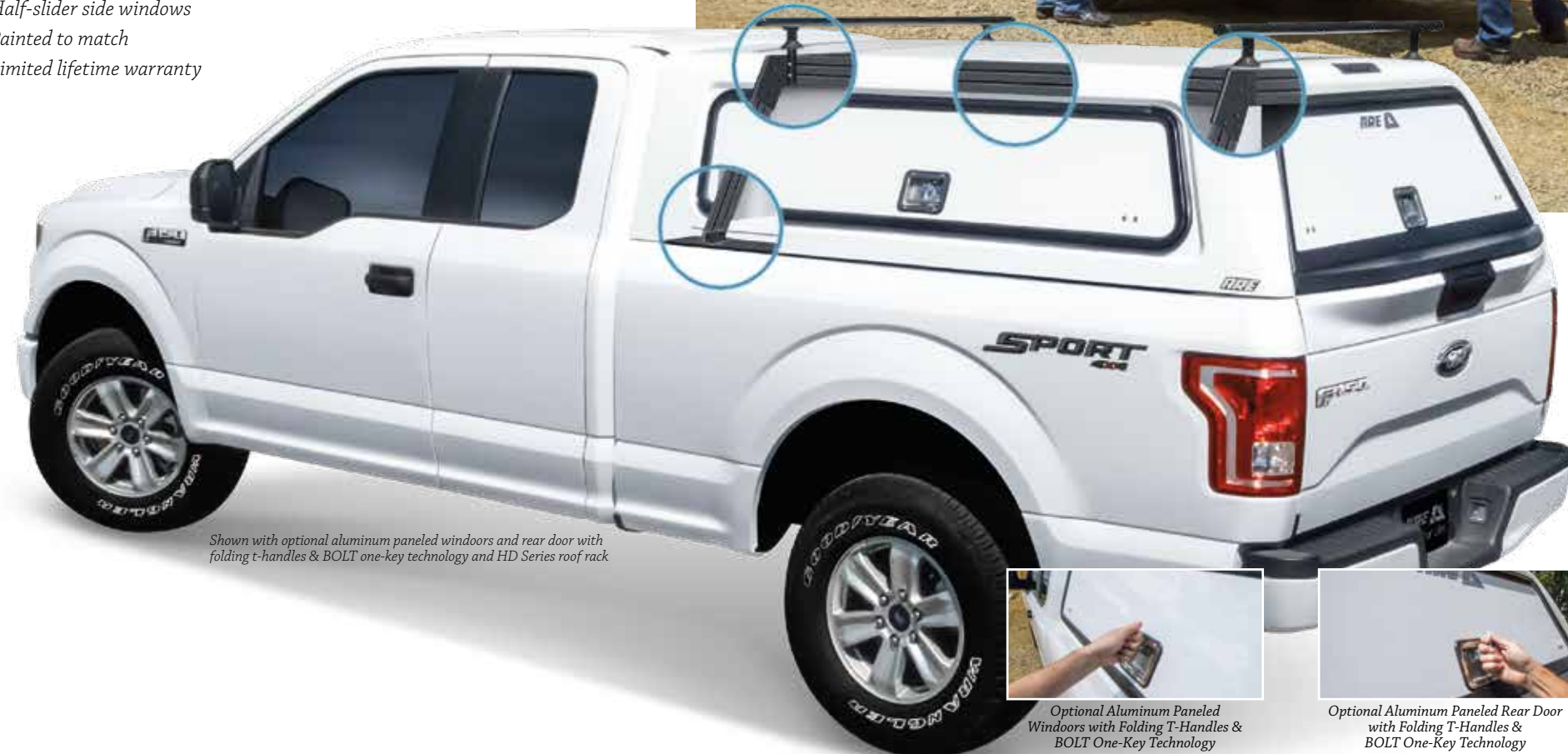
Shown with optional aluminum paneled windows and rear door with folding t-handles & BOLT one-key technology and HD Series roof rack