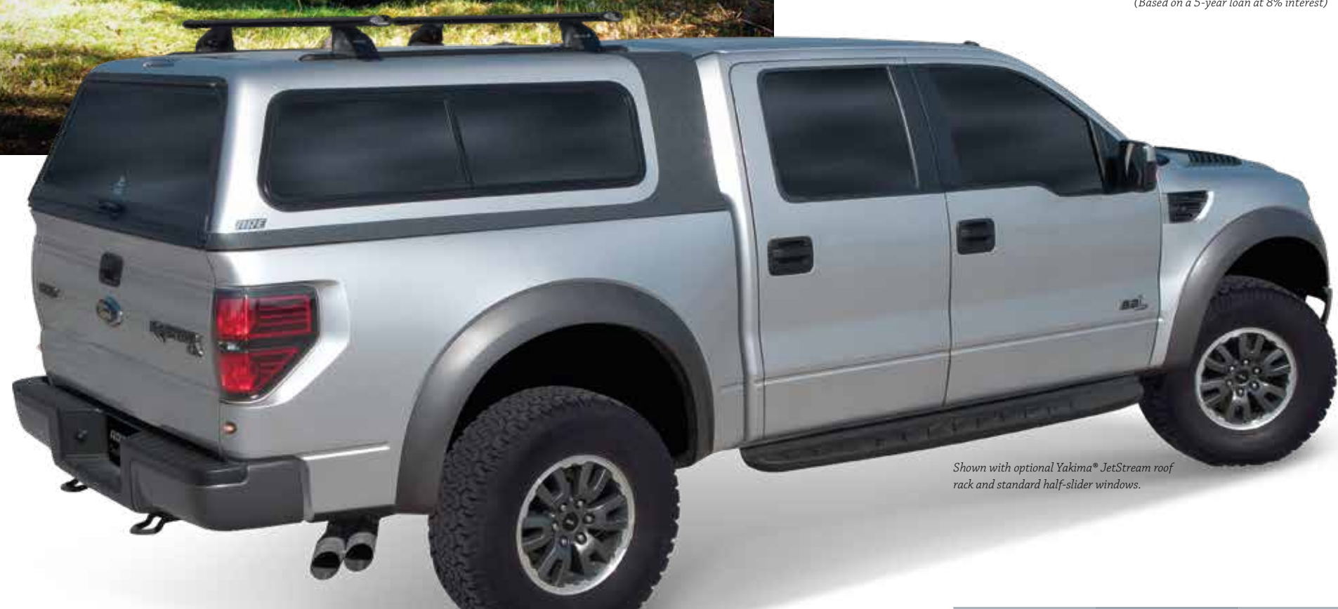
Shown with optional Yakima® JetStream roof rack and standard half-slider windows.