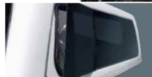
Frameless Screen Vent