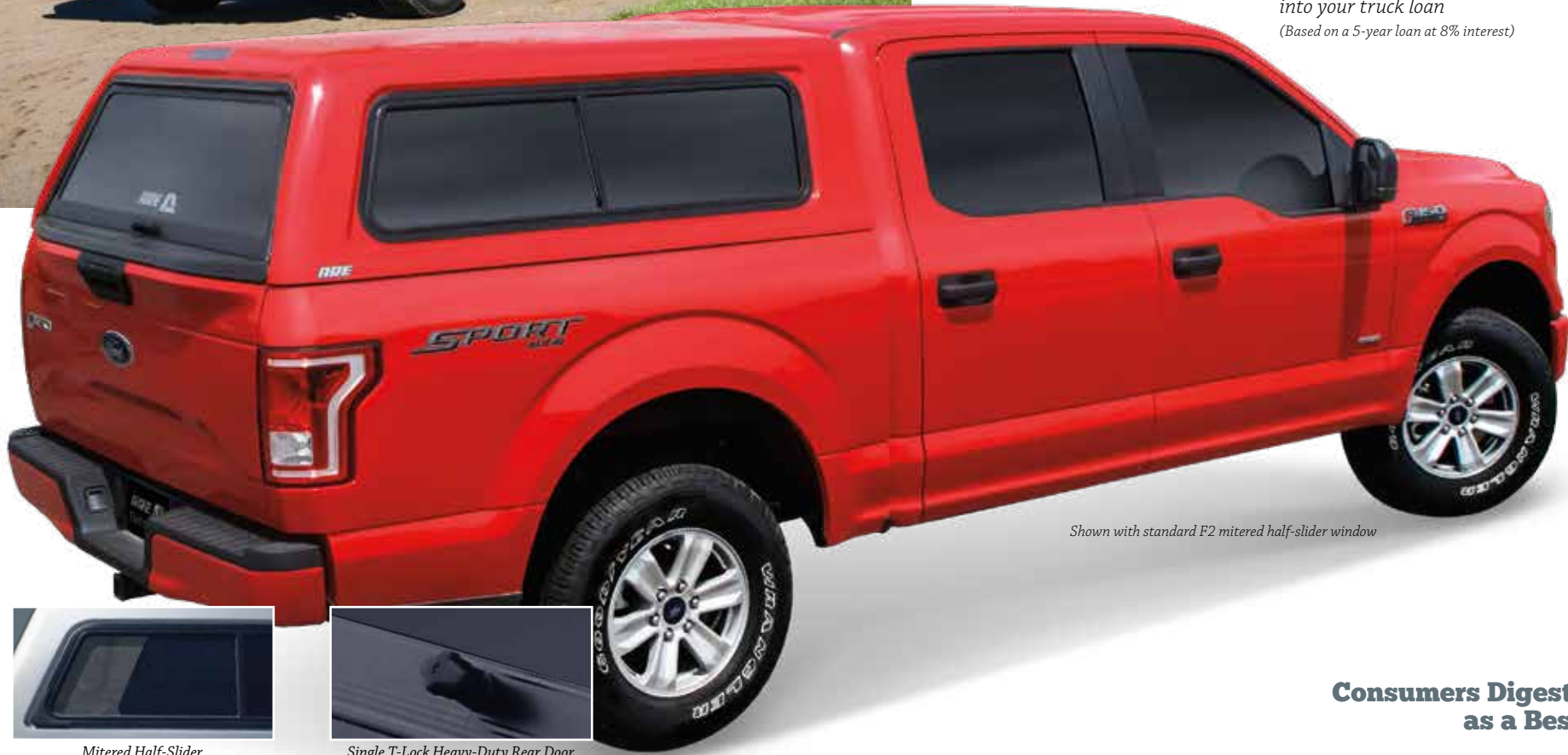
Shown with standard F2 mitered half-slider window