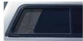
F2 Mitered Half-Slider