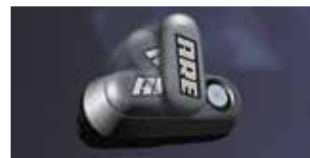
Integrated Palm Handle