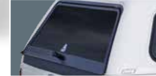
Heavy-Duty Aluminum Door