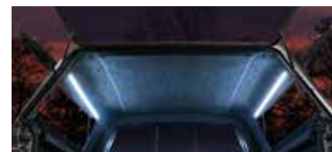
Side Window Rope Lights are automatically activated when the door opens!