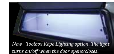
New - Toolbox Rope Lighting option. The light turns on/off when the door opens/closes.