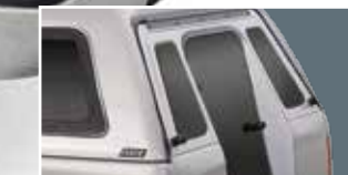
Optional Walk-In Rear Door