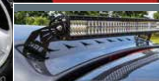
Rival™ LED Light Bar