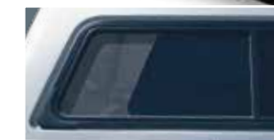
F2 Mitered Half-Slider