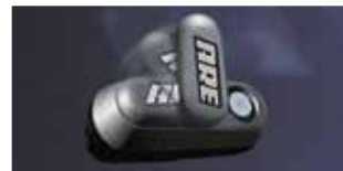
Integrated Palm Handle