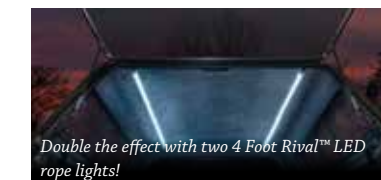
Double the effect with two 4 Foot Rival™ LED rope lights!