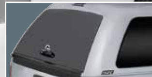
Frameless Curved Door Styling