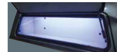
New - Toolbox Rope Lighting option. The light turns on/off when the door opens/closes.