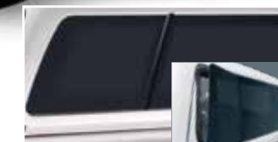
Optional SV Screen Vent Window Package