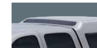
Front Vista Glass (Not a Skylight)