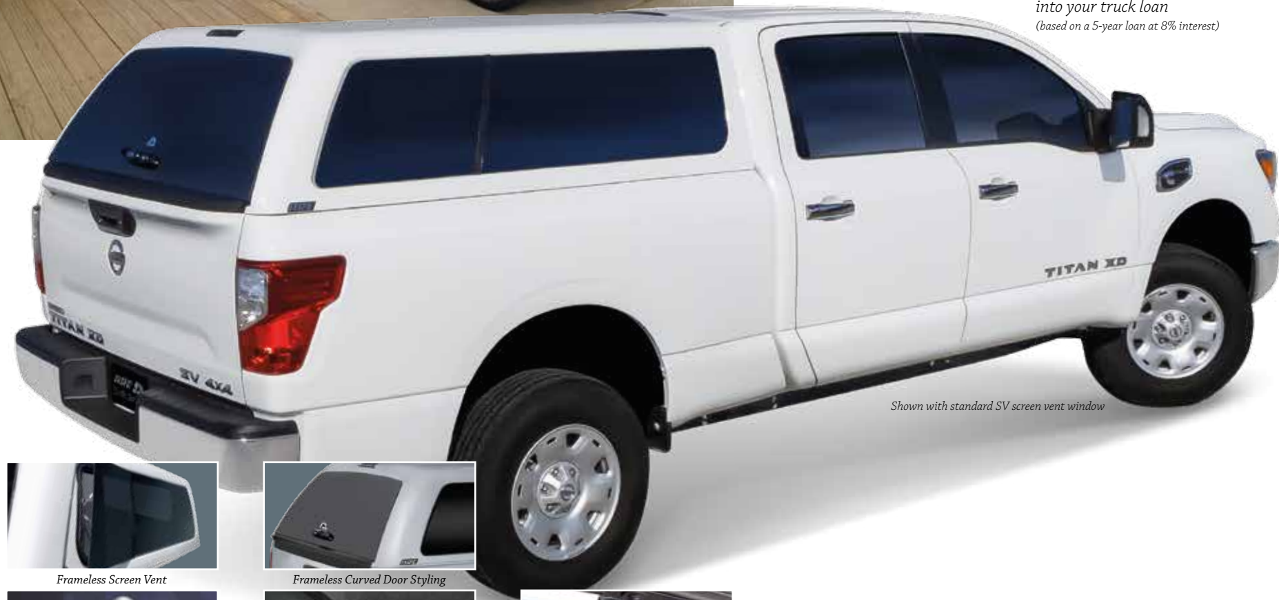
Shown with standard SV screen vent window