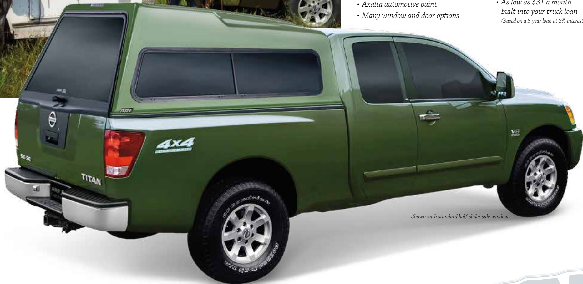
Shown with standard half-slider side window