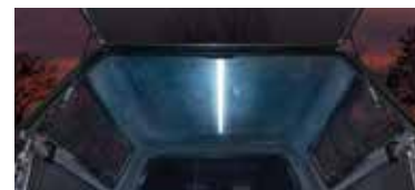
4' Center Rope Light - fiberglass truck cap with fabric interior liner.