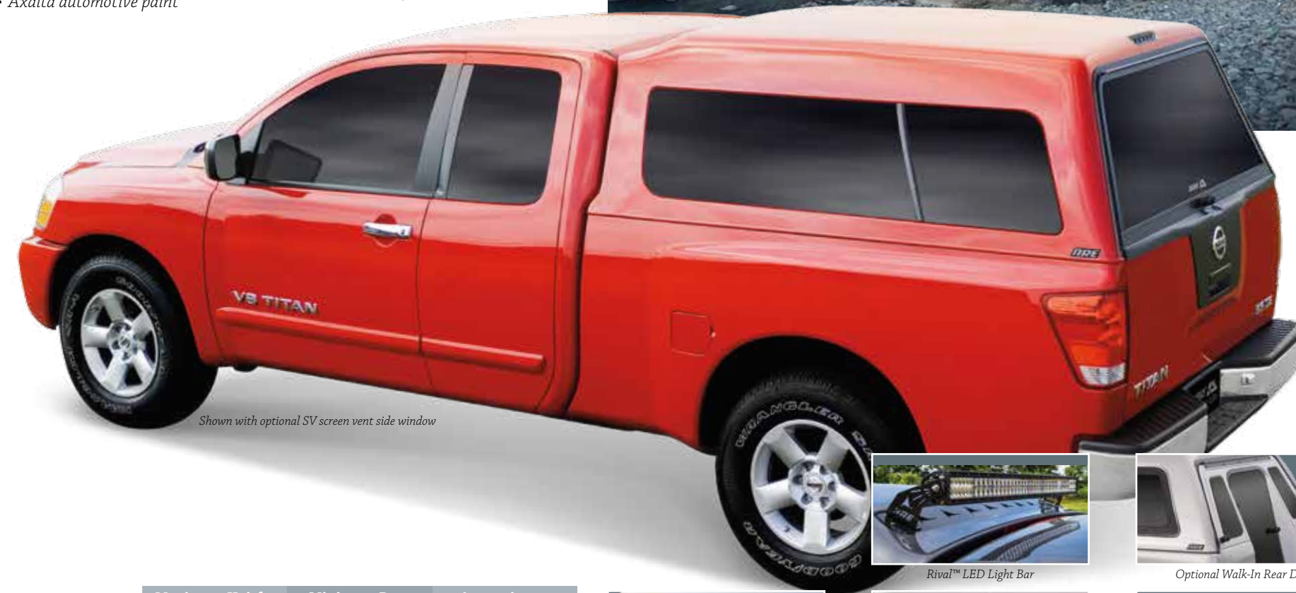
Shown with optional SV screen vent side window