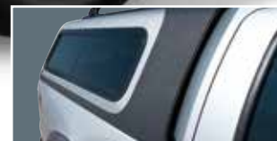
Spray-On Protective Coating Increases Strength in High Stress Areas