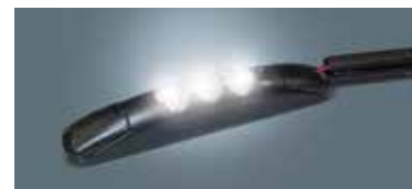
The new 3 Rival™ LED 12-Volt Light lighting option that replaces the incandescent 12-Volt light.