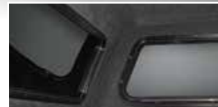
Gray Carpet Interior