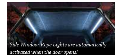
Side Window Rope Lights are automatically activated when the door opens!