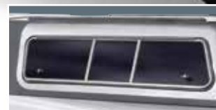
Optional Outdoorsman Window Package