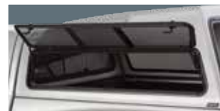
Outdoorsman Window (vented)