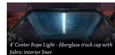
4' Center Rope Light - fiberglass truck cap with fabric interior liner.