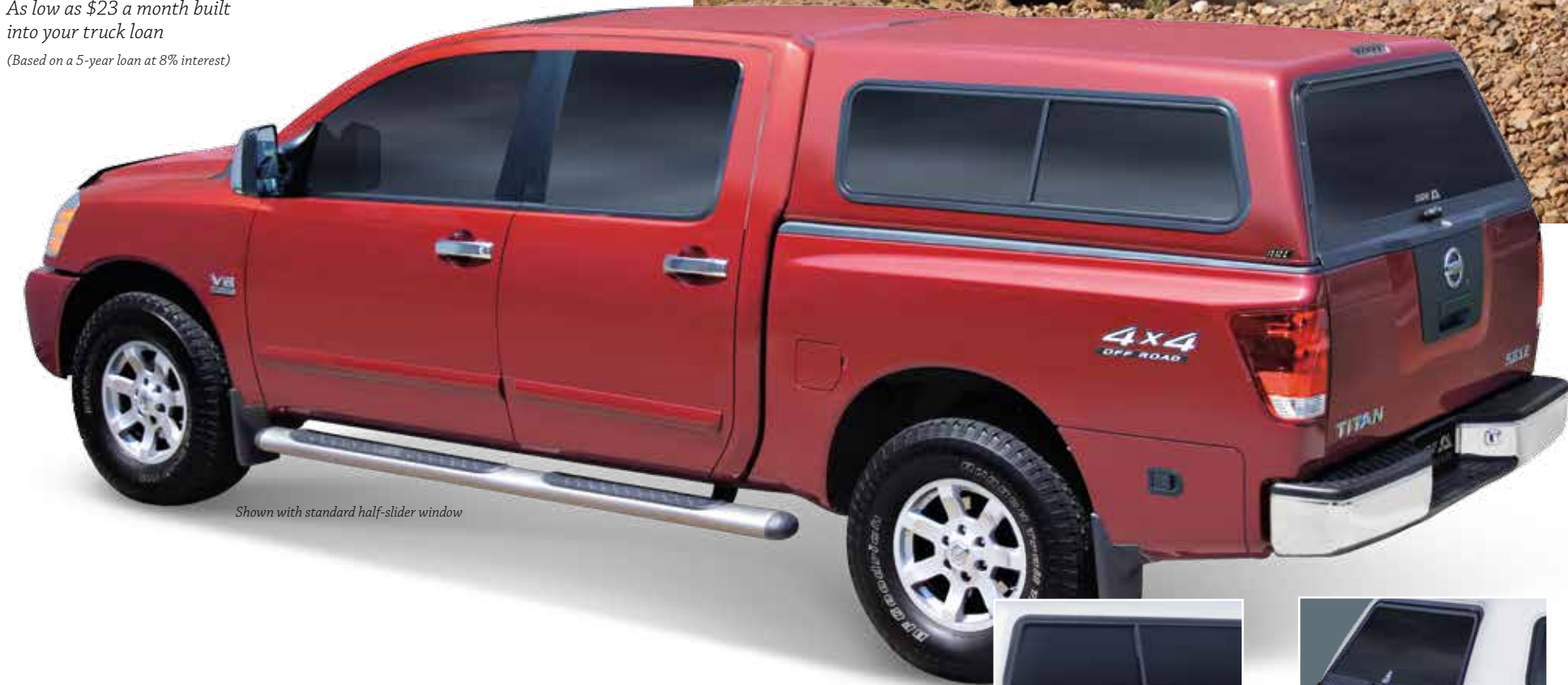
Shown with standard half-slider window