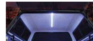
4' Center Rope Light - fiberglass truck cap without fabric interior liner.