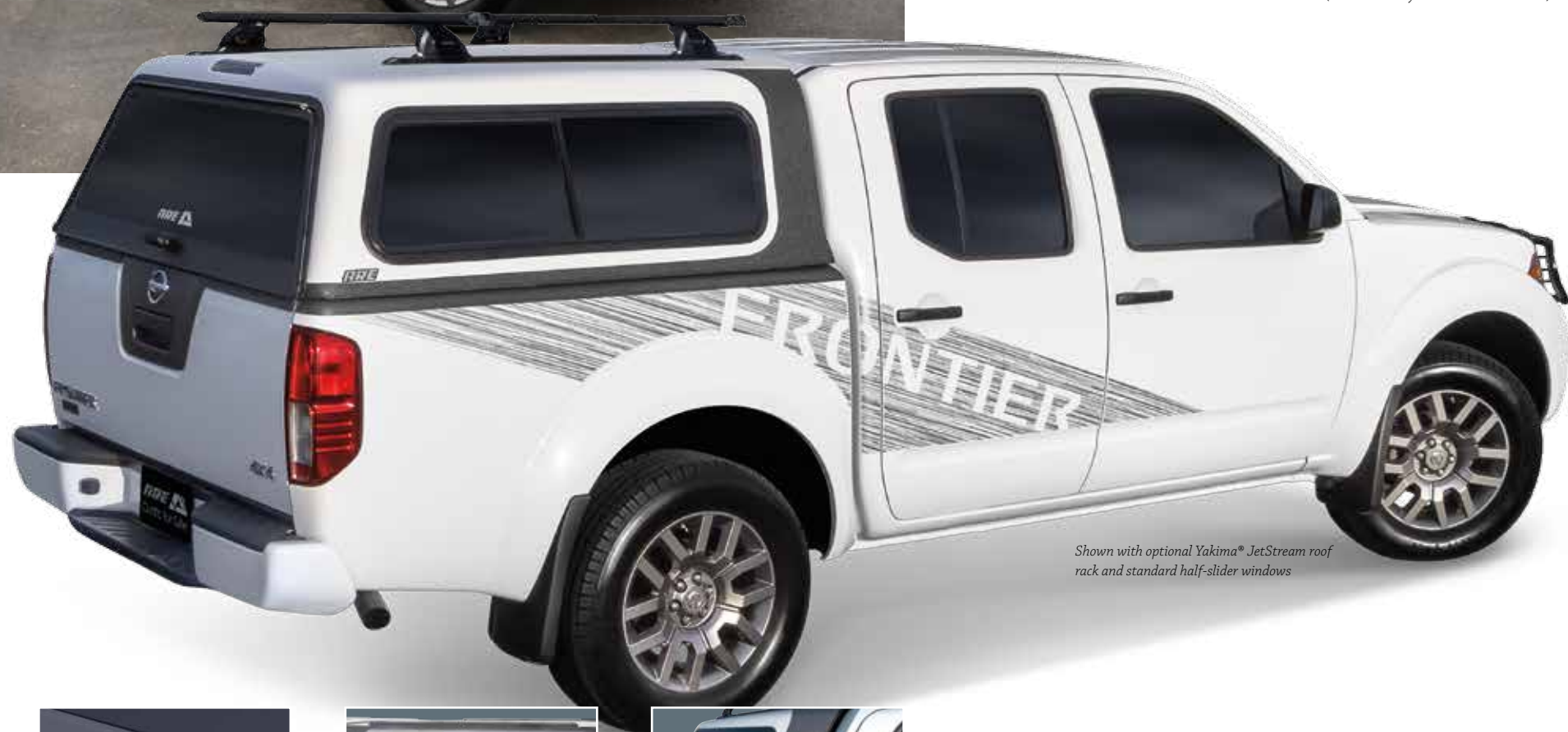
Shown with optional Yakima® JetStream roof rack and standard half-slider windows