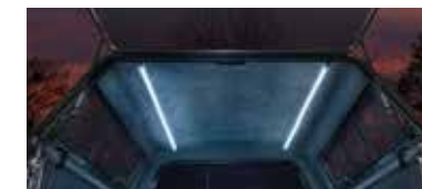
Double the effect with two 4 foot LED rope lights!